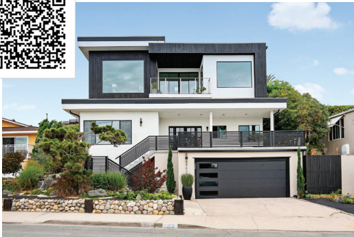
Whole House Remodel with Second Story Addition