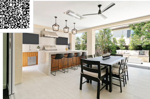
Outdoor Living Area (OLA) Remodel