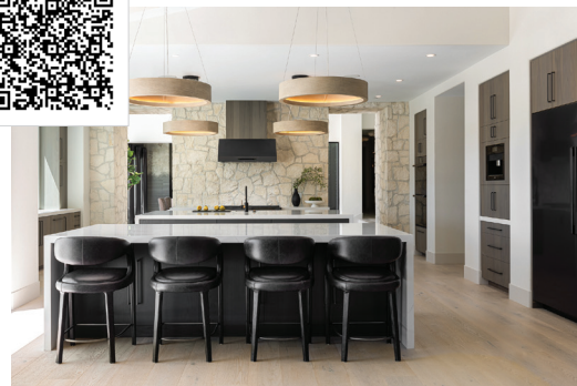
Whole House Remodel with Addition and OLA