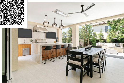
Outdoor Living Area (OLA) Addition