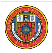
BA of Science: Finance Fairfield University