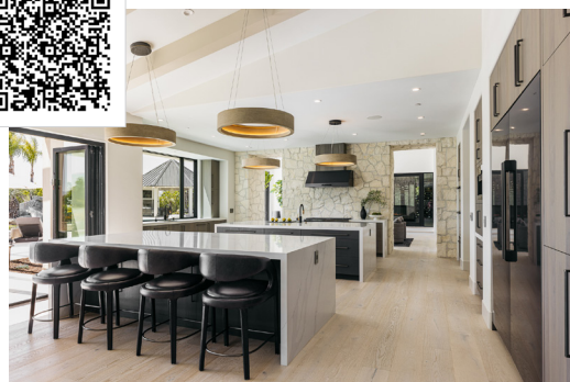
Whole House Remodel with Addition and OLA