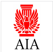
American Institute of Architects Associate Membership