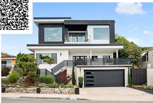
Whole House Remodel with Second Story Addition