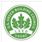
U.S. Green Building Council LEED Accredited Professional