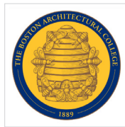
Master of Architecture Boston Architectural College.