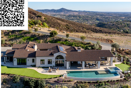
New Custom Home