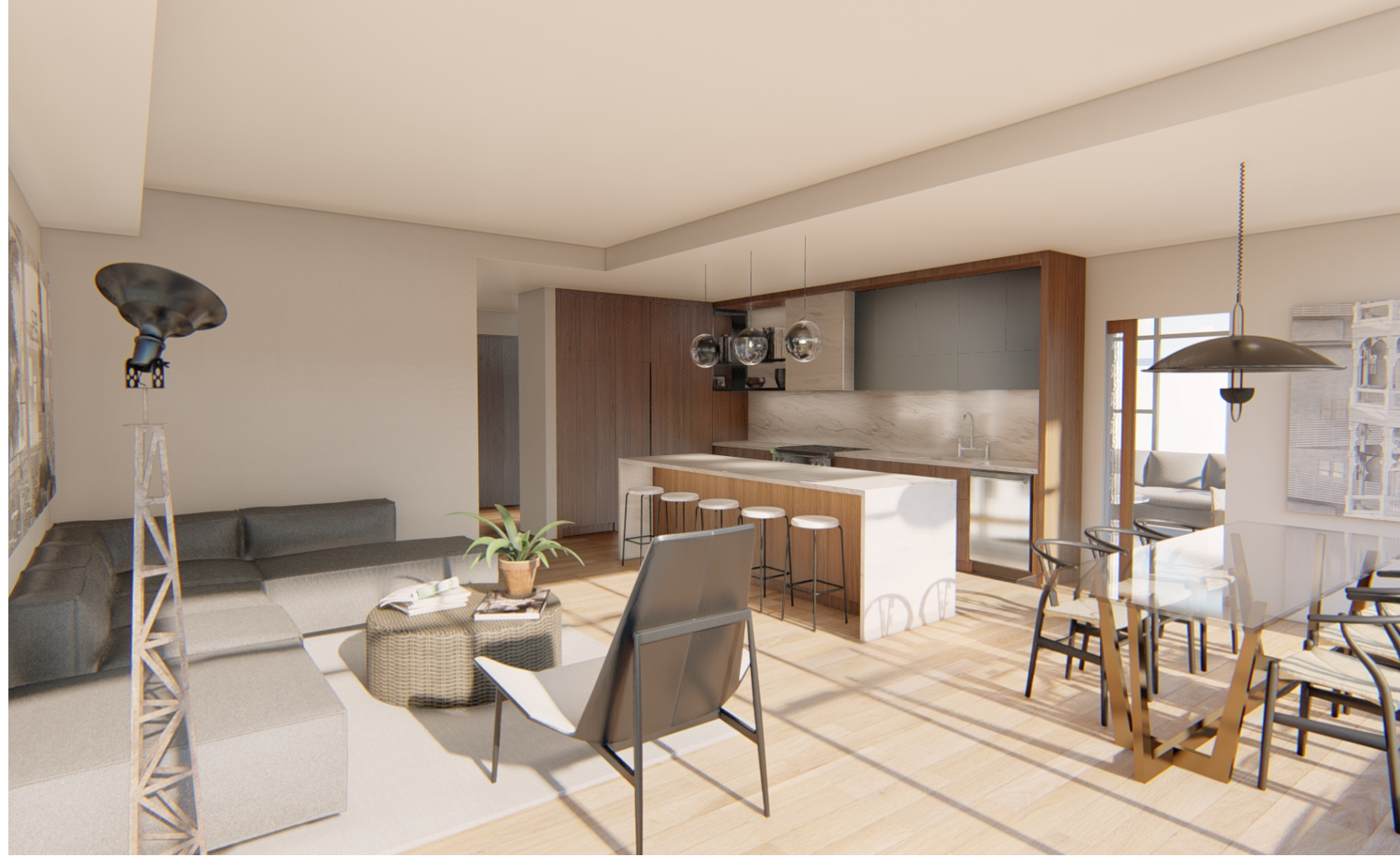
KITCHEN: CONCEPT PLAN & RENDERING